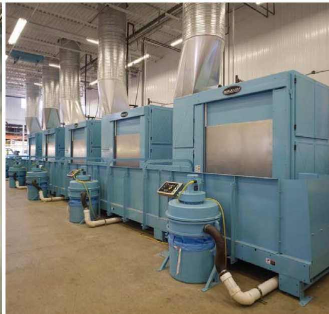
A shuttle system (at center/right) services these five 500 lb. dryers with two-batch, two-cake storage and transport, thus saving labor and improving throughput efficiency.